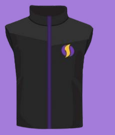
FS1-Y13 UNISEX SPORTS BREEZER