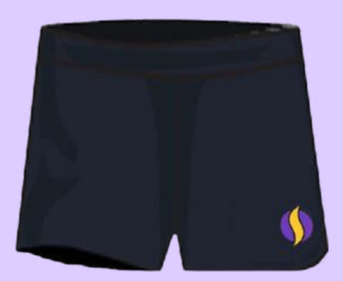
FS1-Y13 BOYS SWIM SHORTS