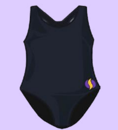
FS1-Y13 GIRLS SWIMSUIT (OR SURRIDGE ALTERNATIVE)