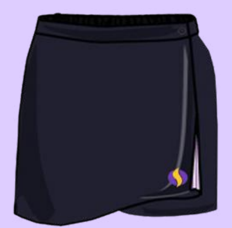
FS2-Y6 GIRLS SKORTS H/B