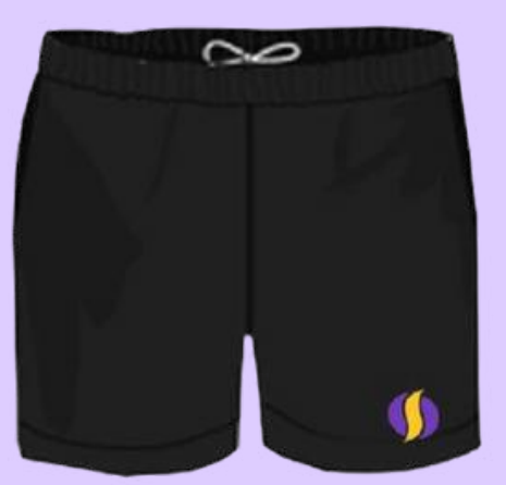
Y7-Y13 GIRLS PE SHORTS