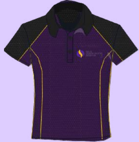
Y7-Y13 BOYS PE SHIRT/TOP

Year 7 to Year 13 students wear SCS uniform supplied by Sumeru.