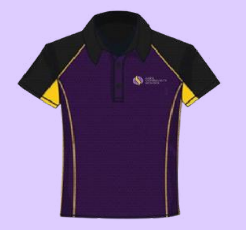
FS1-Y6 UNISEX PE SHIRT/TOP

Long trousers are available as an optional alternative to the skorts.