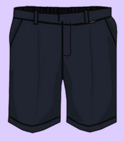
FS2-Y6 BOYS SHORTS H/B