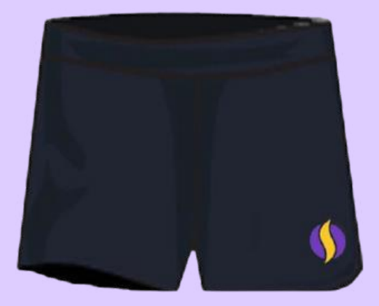
FS1-Y13 BOYS SWIM SHORTS