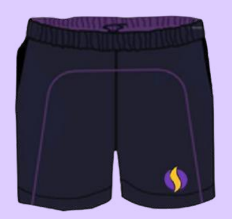
FS2-Y6 UNISEX PE SHORTS