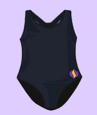
FS1-Y13 GIRLS SWIMSUIT (OR SURRIDGE ALTERNATIVE)