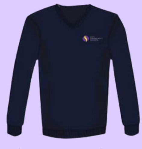
FS1-Y11 UNISEX JUMPER