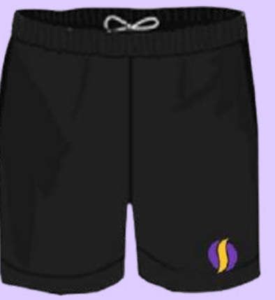
Y7-Y13 BOYS PE SHORTS