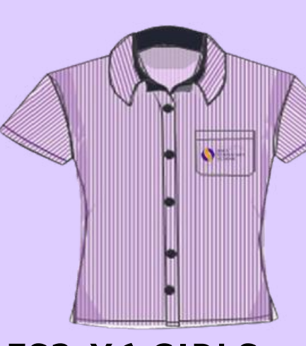
FS2-Y6 GIRLS PURPLE SHIRT