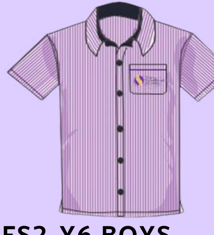
FS2-Y6 BOYS PURPLE SHIRT

Long trousers are available as an optional alternative to the skorts.