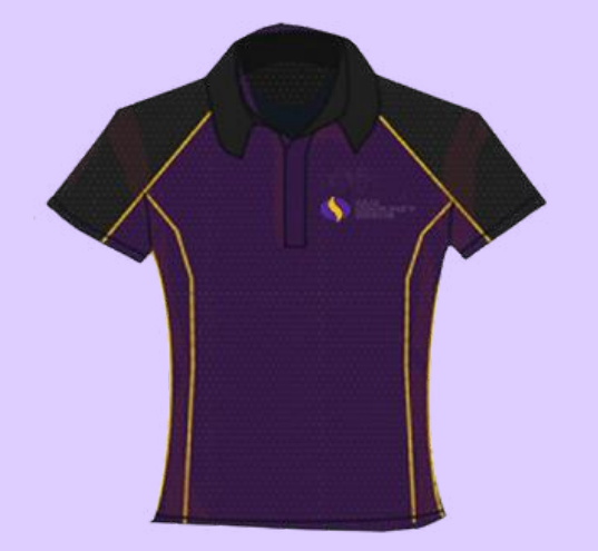
Y7-Y13 GIRLS PE SHIRT/TOP