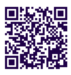
See our Foundation Stage Teachers